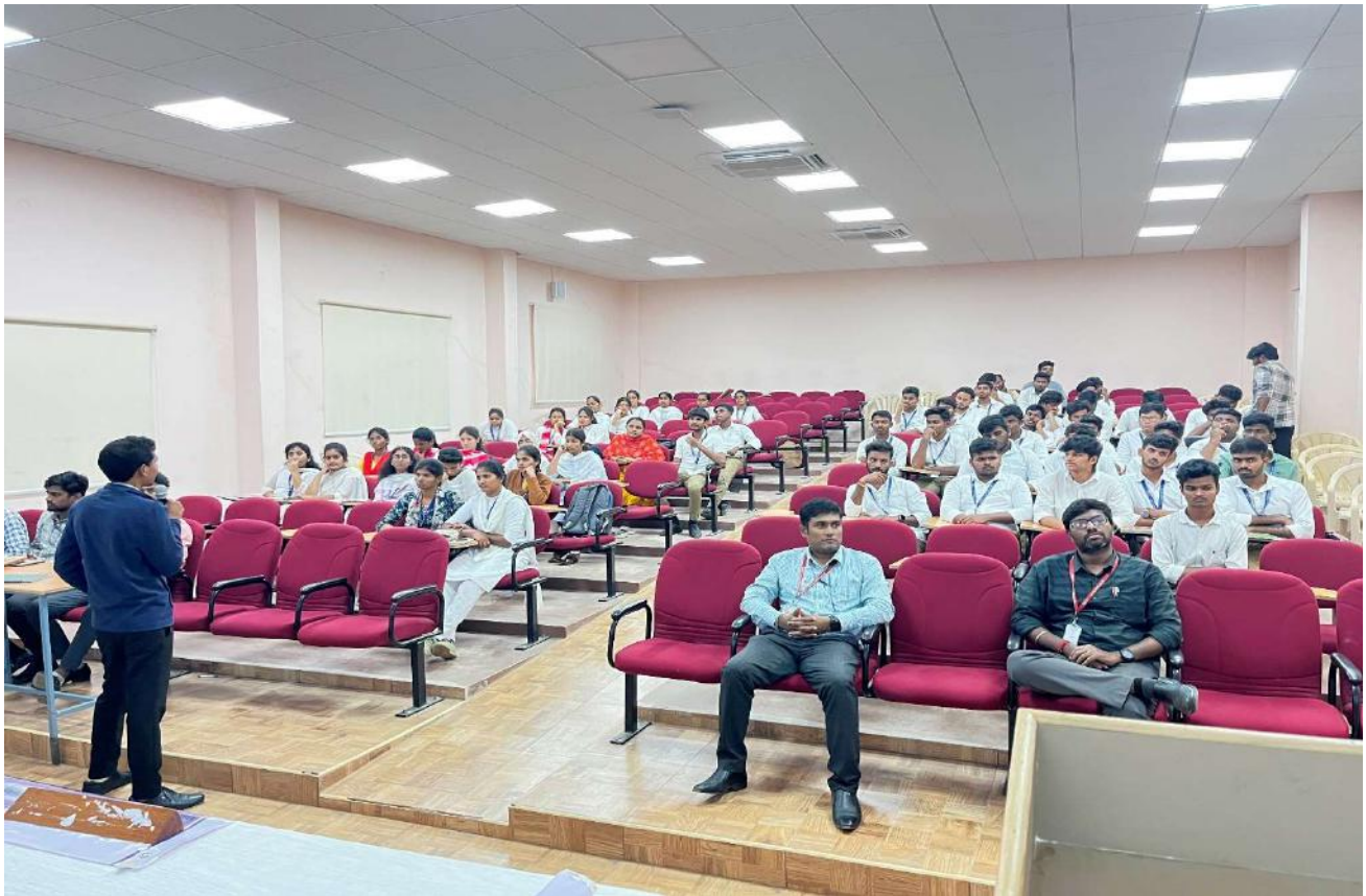
Fig 2: Audience listening to presentations